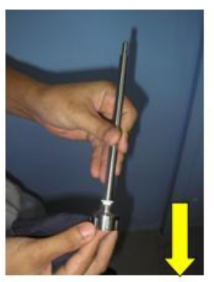
remove rotor stator and teflon bearing

To assemble backthe shaft follow the procedure in reverse order! Handtight assembly is sufficient!