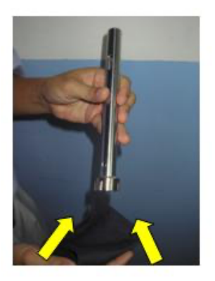
Use a piece of cloth to hold the stator as the teeth are sharp and can cut you! While holding the stator turn the shaft tube clockwise!