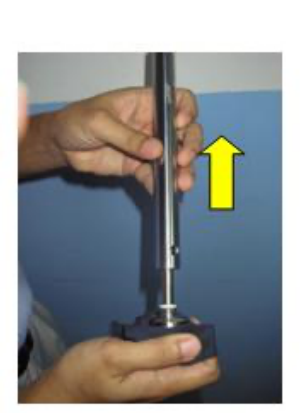
remove shaft tube and put it at a place where it cannot fall down as impact might damage it

2. Now hold the rotor with a cloth and turn the axle anticlockwise. Slowly screw the axle from the rotor and put it aside.