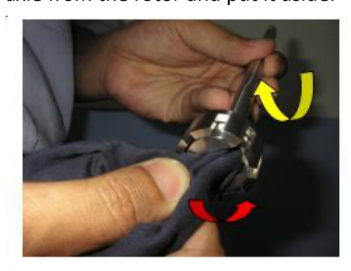
Next hold the rotor with the cloth and turn the axle clockwise (yellow arrow) or hold the the axle and turn the rotor anticlock wise (red arrow)

2. Now hold the rotor with a cloth and turn the axle anticlockwise. Slowly screw the axle from the rotor and put it aside.